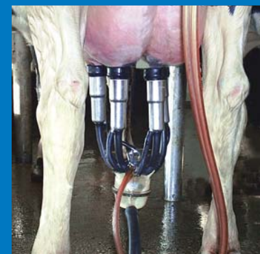
The MAX aligns better regardless of teat placement

The internal capacity of the MAX is over 11.5 oz (340 ml), making it one of the largest capacity claws on the market today. Even the highest producing cows cannot flood the MAX.